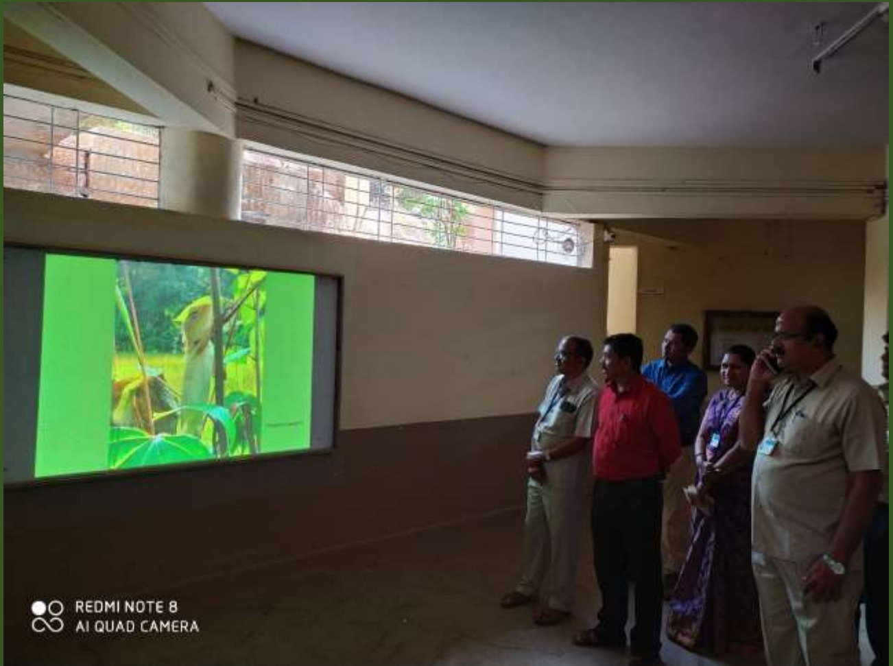
World Wildlife Day, Animal Photography Competition, 2019-20