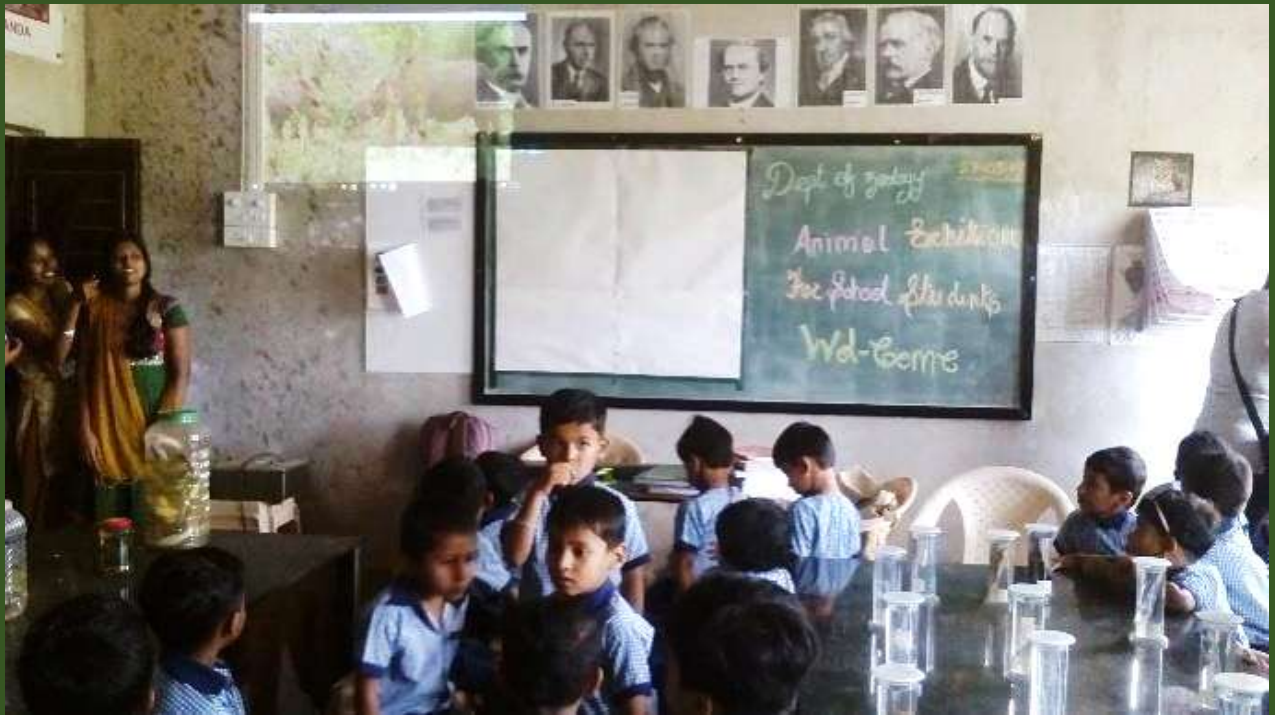
Animal exhibition for school students- animal shortvideo film