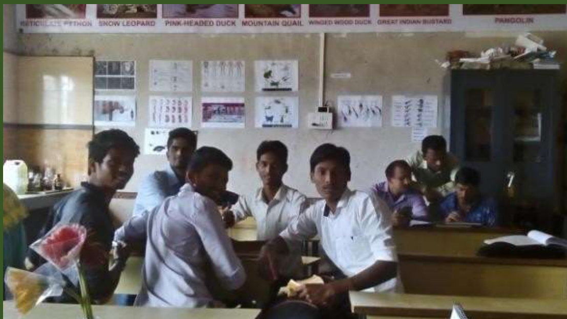
Happy moment in lab with students of 2015-16 batch