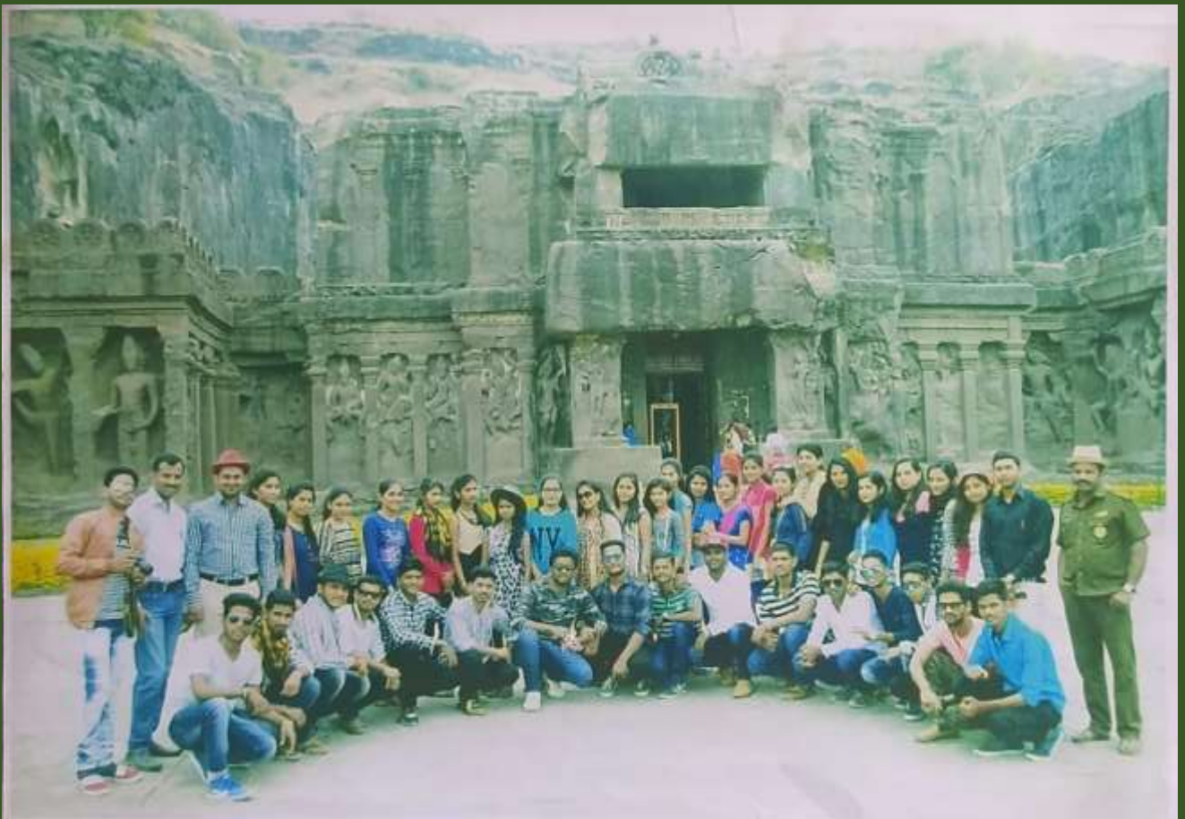
Excursion at Ajintha, Verul, Dr.BabasahebAmbedkarMarathwadiUniversity,Aurangabad 2017-18