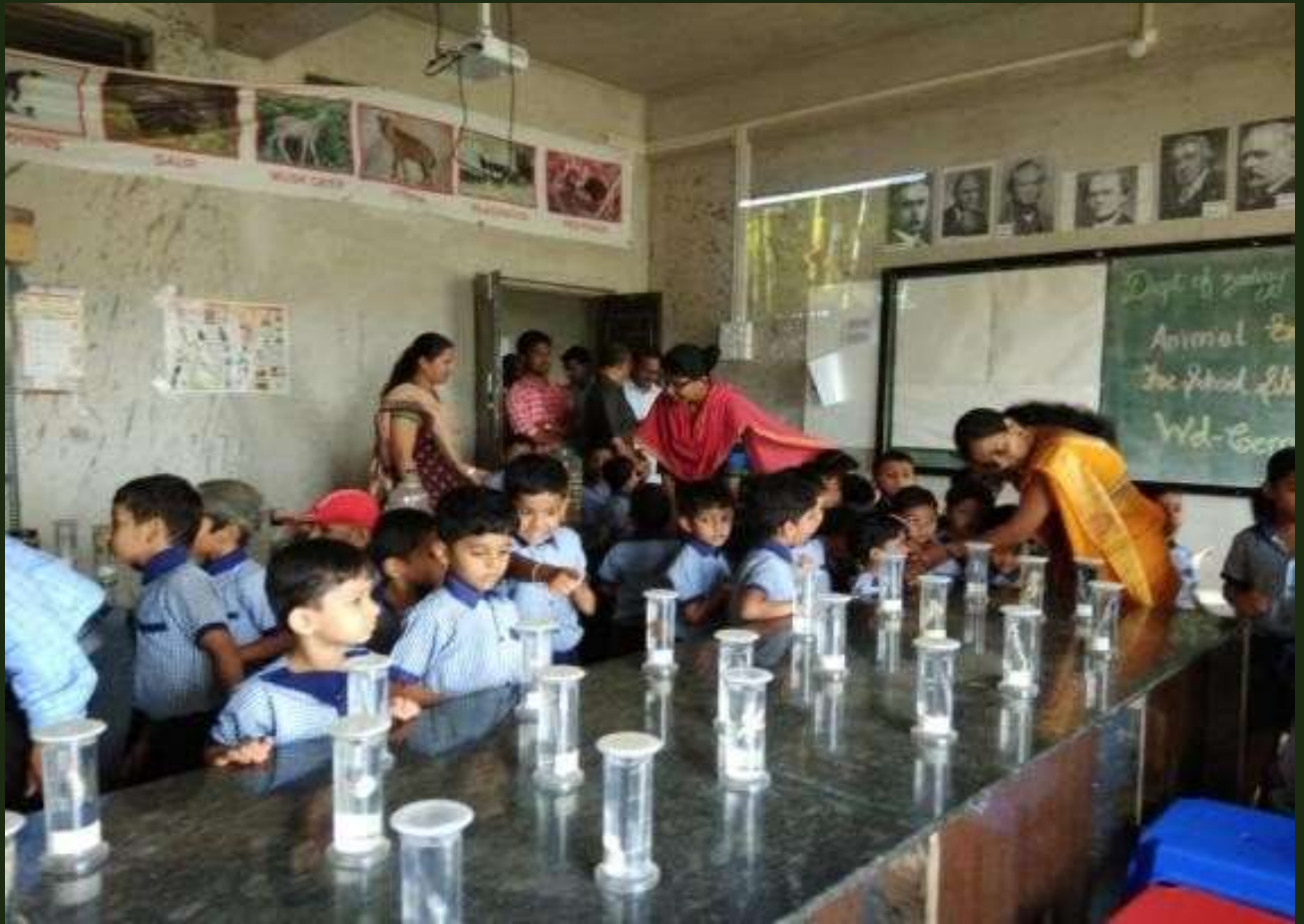
Animal exhibition for school students- students observing animal specimens, 2018-19