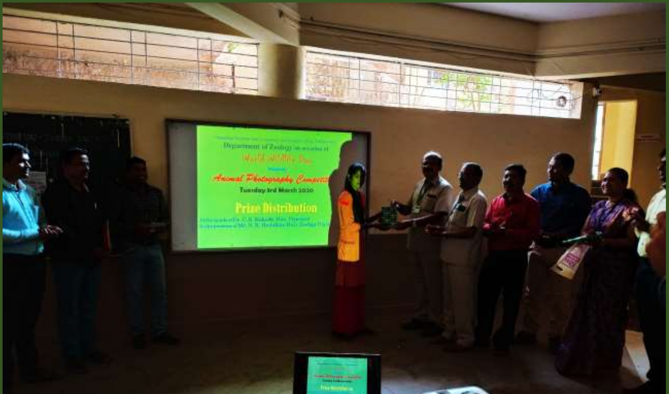
World Wildlife Day, Animal Photography Competition, 2019-20 Prize distribution