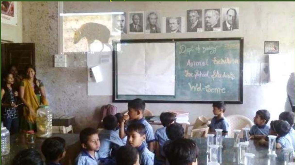
A moment during Animal exhibition for schoolstudents, 2018-19