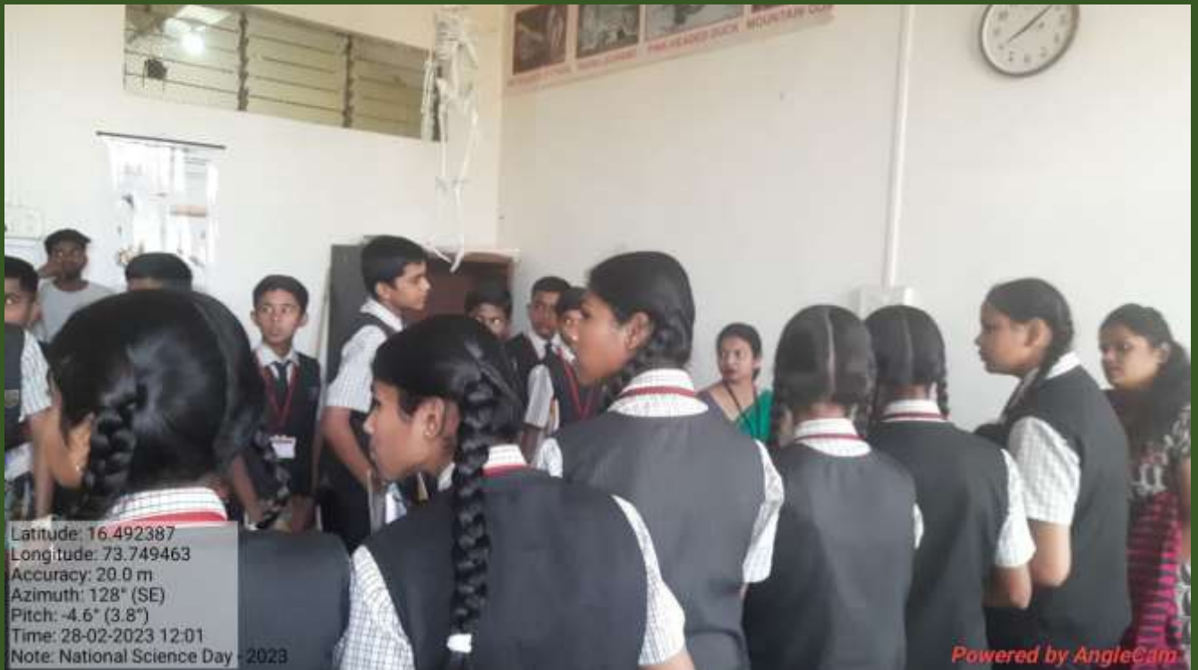
National Science Day celebration 28/02/2023

Latitude: 16.492387 Longitude: 73.749463 Accuracy: 20.0 m Azimuth: 128° (SE) Pitch: -4.6° (3.8°) Time: 28-02-2023 12:01 Note: National Science Day - 2023