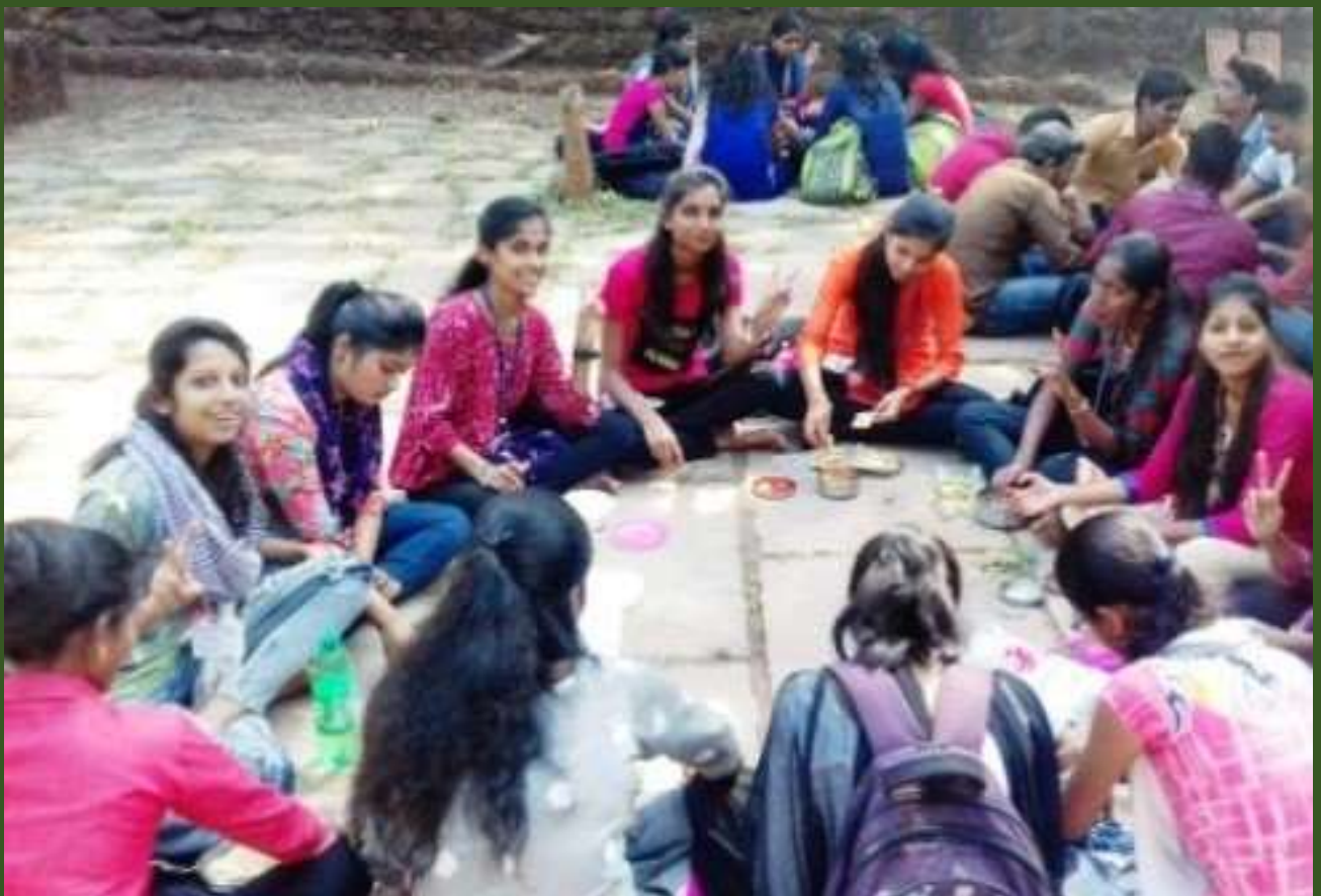
Excursion group photo at Kokisare, Tal-vaibhavwadi, 2018-19