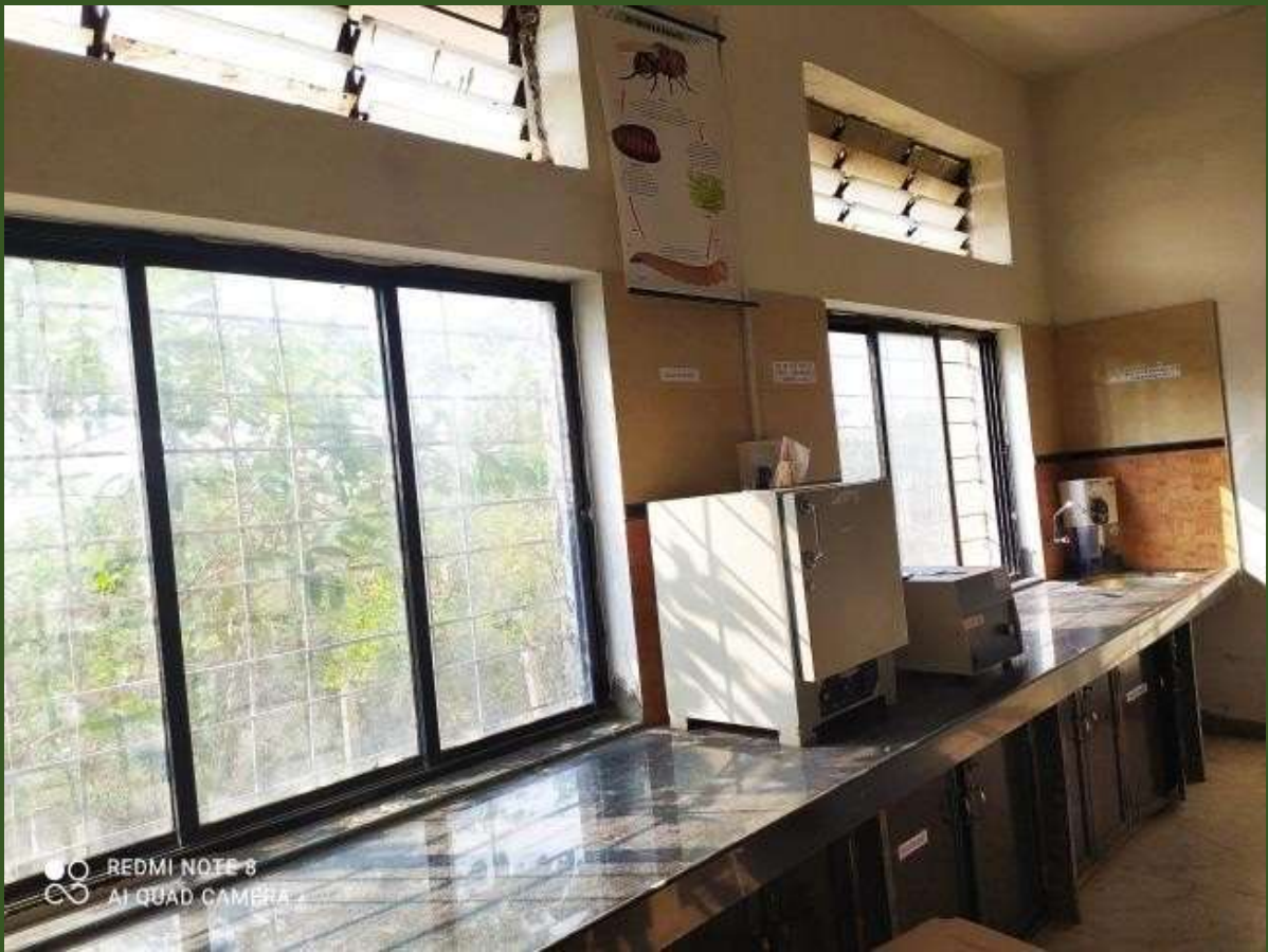
Zoology Lab 01