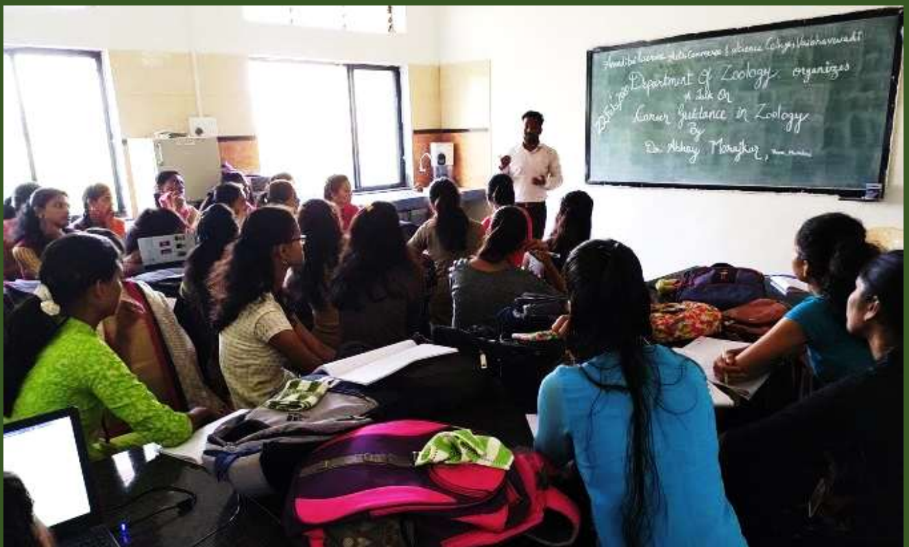
Lecture on Career Guidance in Zoology 22/2/2020