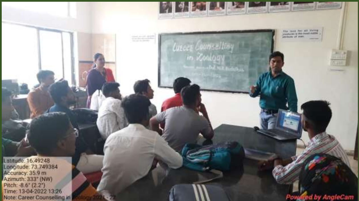
Lecture on Career Guidance in Zoology 13/04/2022