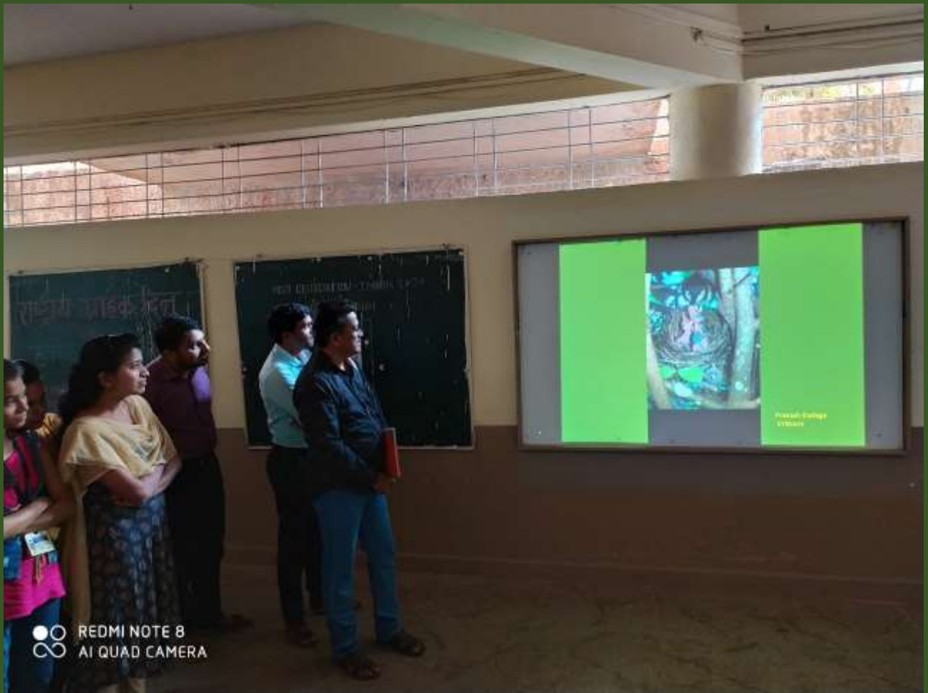
World Wildlife Day, Animal Photography Competition, 2019-20 A photo for display