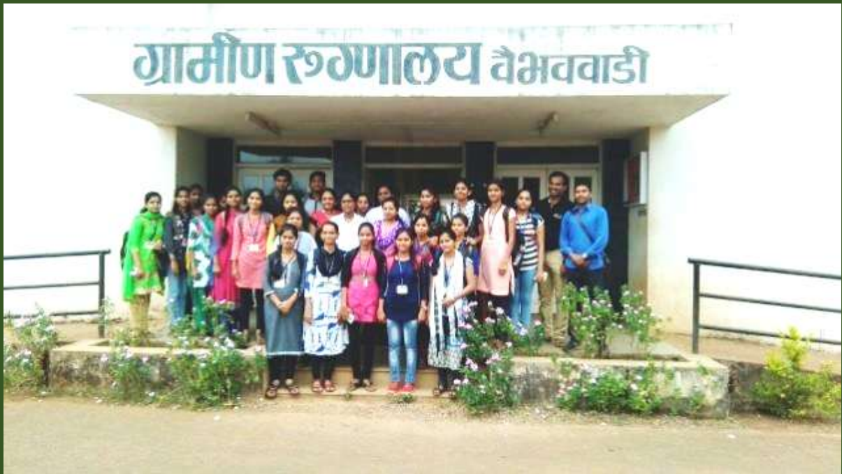
Rural Hospital, Vaibhavwadi Visit, 2017-18.