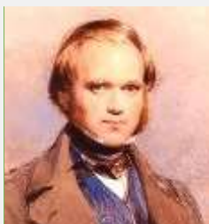
Charles Robert Darwin

ANANDIBAI RAORANE ARTS, COMMERCE AND SCIENCE COLLEGE, VAIBHAVWADI