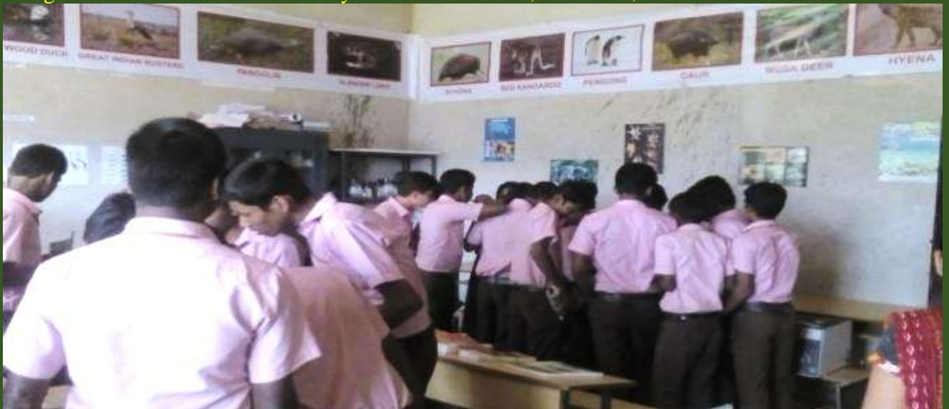
Overwhelming response to the Science Exhibition by School Students 27 Jan.2016