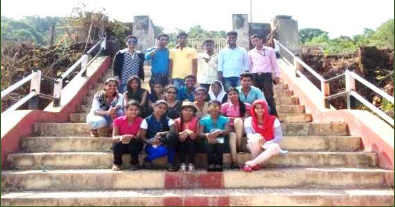
Excursion group photo at Devgad, Tal-Devgad, 2015-16.