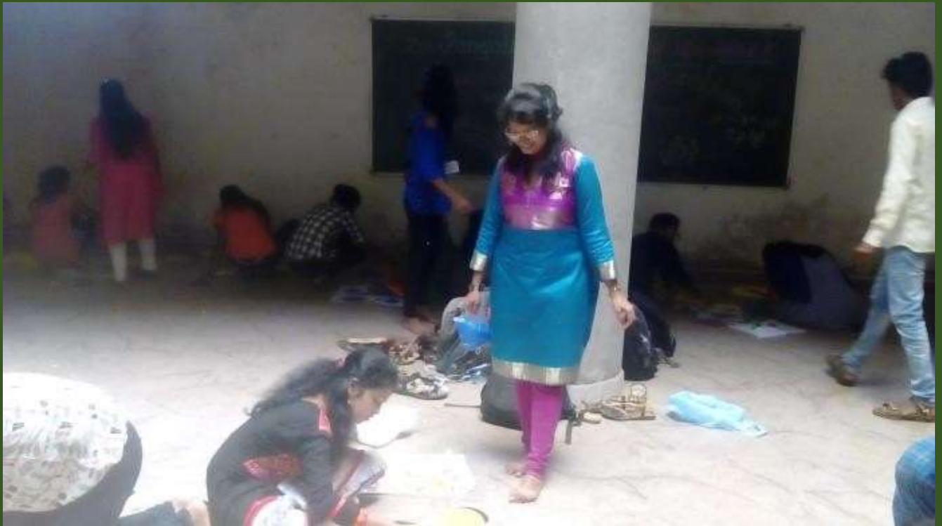
A moment during Zoo Rangoli Competition, 2018-19