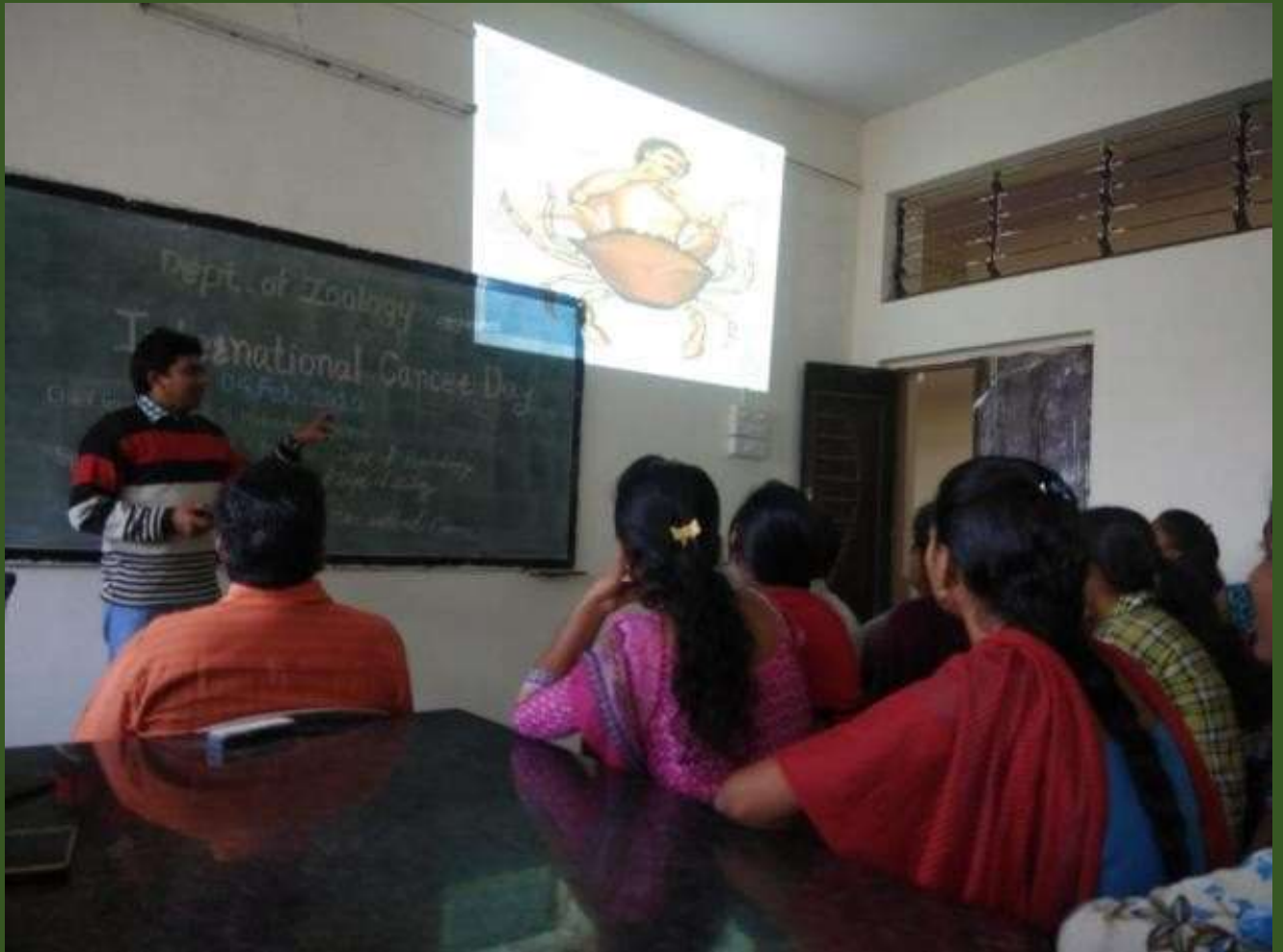
International cancer Day 4/2/2020