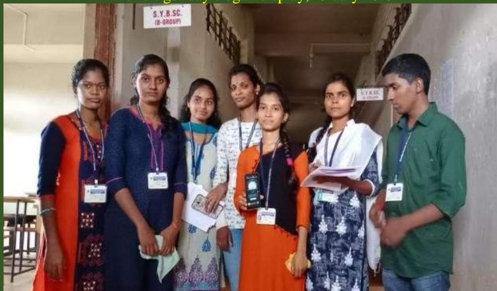
Recording of Noise levels in college campus, 2018-19