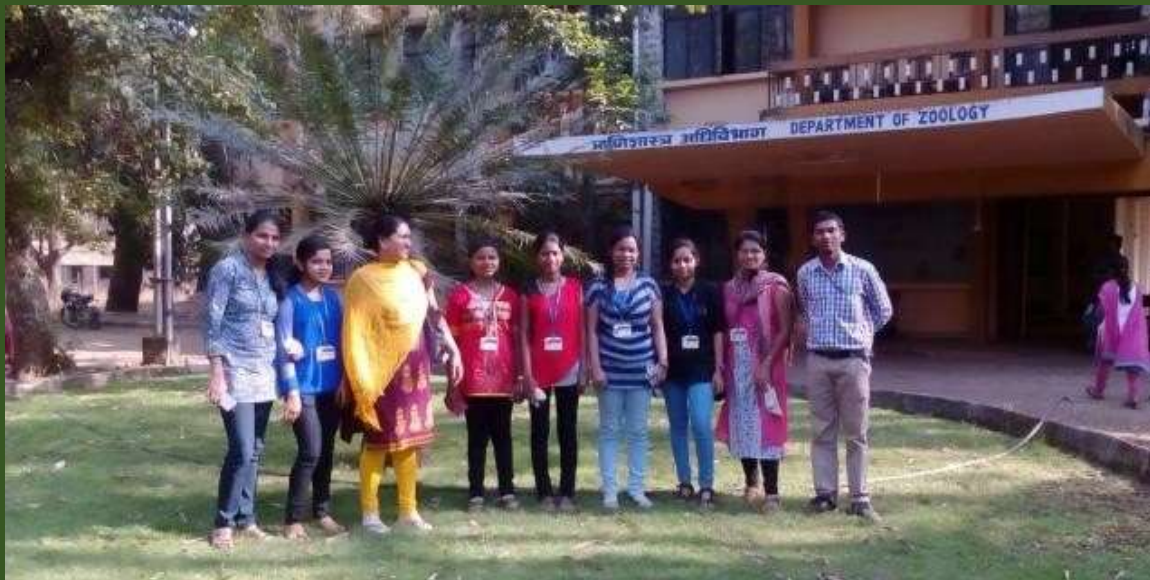
* Excursion at Zoology Department, Shivaji University, Kolhapur.2016-17 * Students observing specimens at Zoology Department, Shivaji University, Kolhapur.2016-17