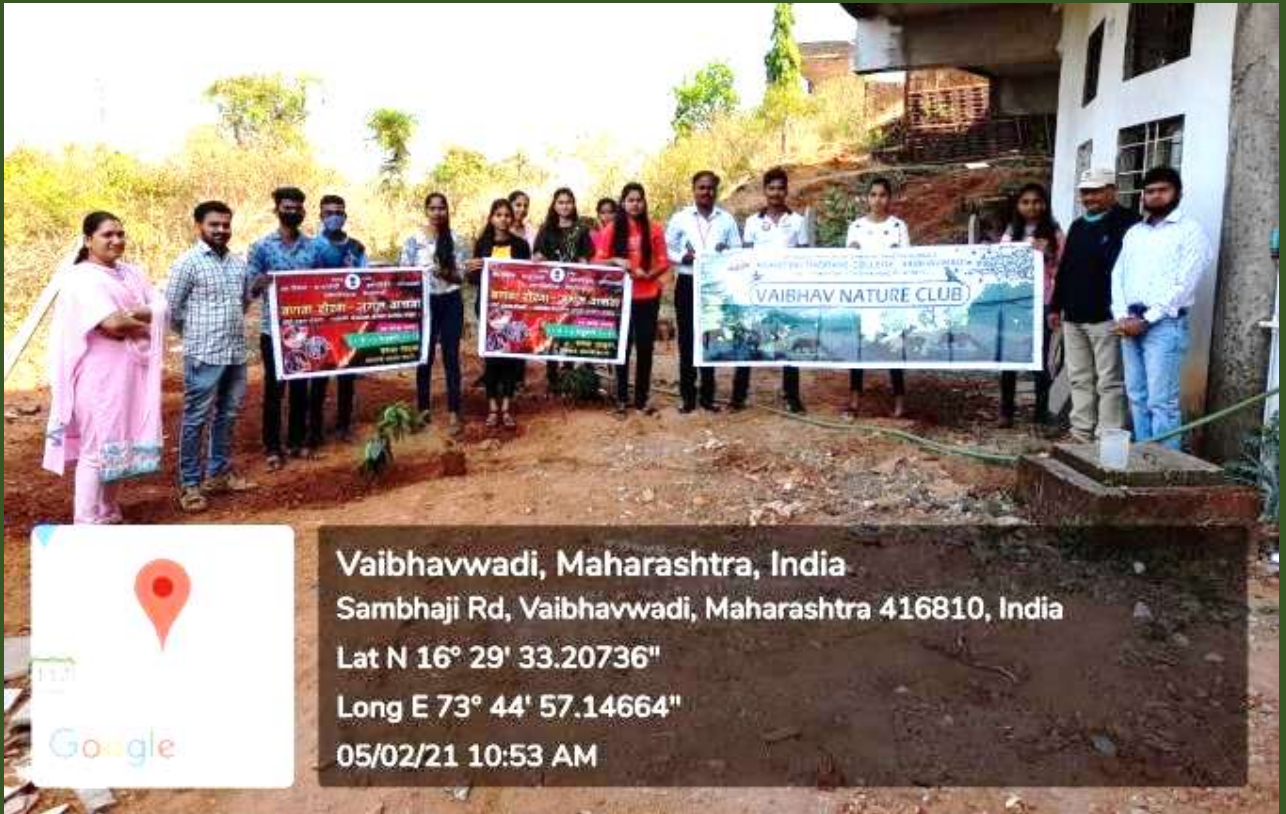
Fire Prevention Week 2021