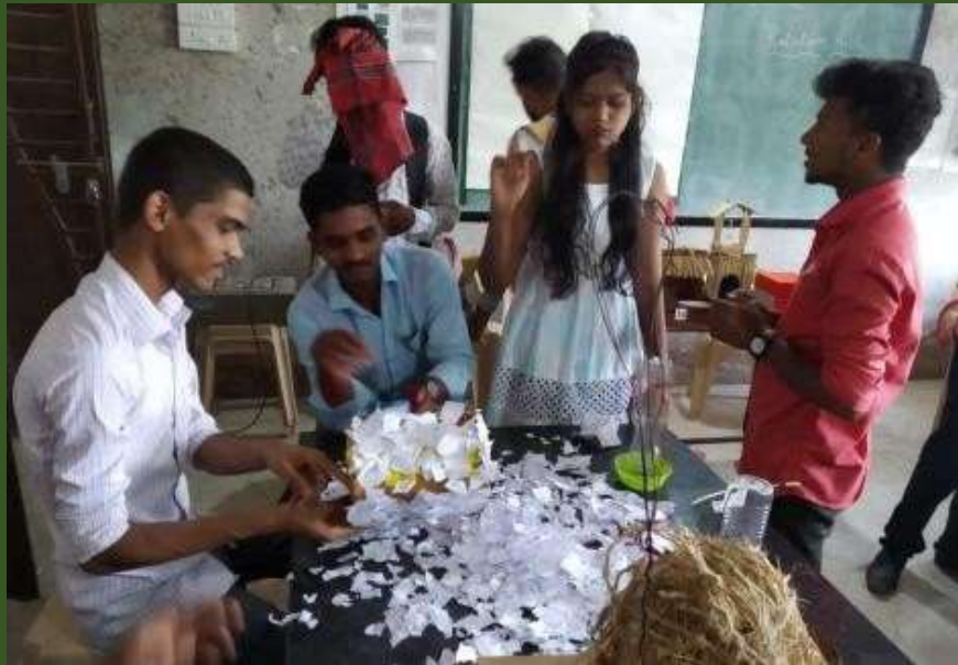
Innovative nest and feeder making competition. Students making nests in Zoology Lab., 2018-19 * Innovative nest and feeder making competition- the nests displayed for competition.