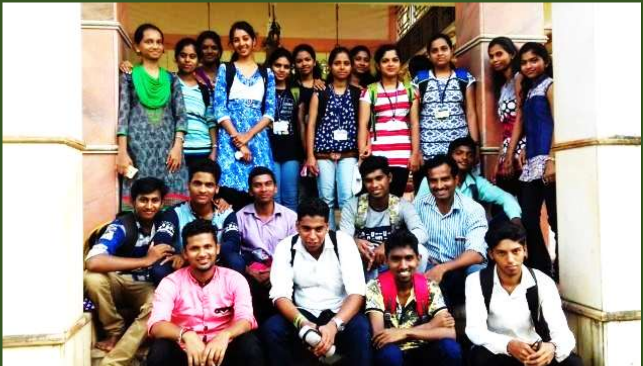
Excursion group photo at Bhuibavada, Tal-vaibhavwadi, 2017-18