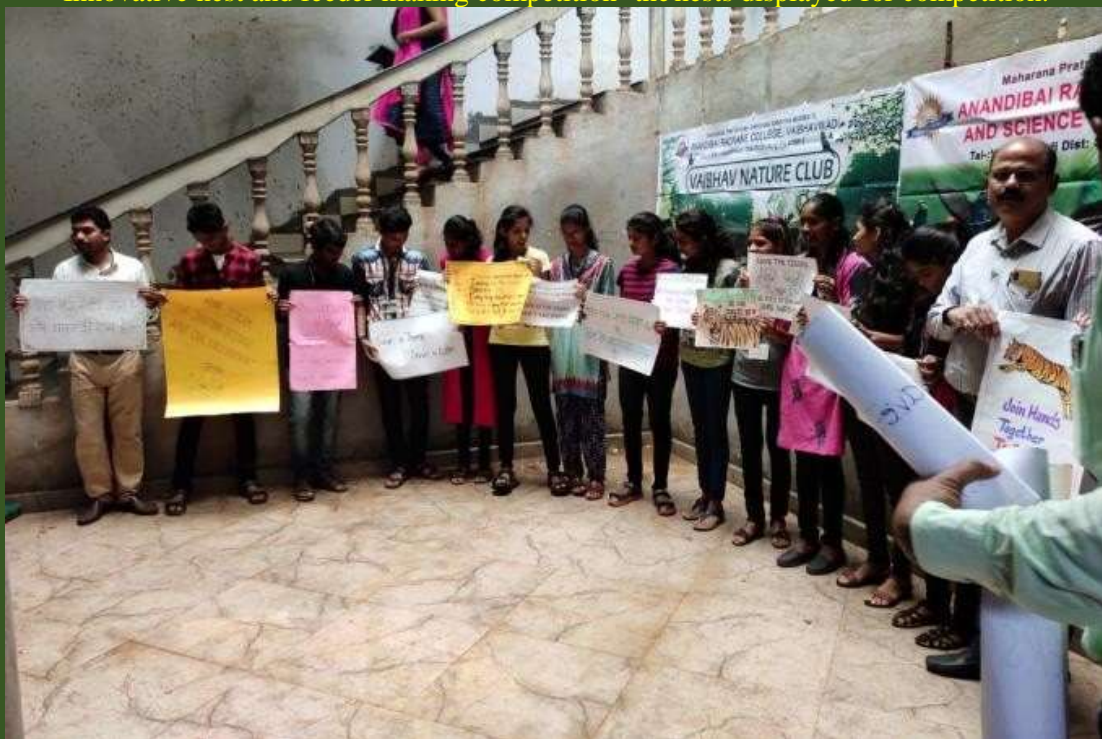
World tiger day slogan display, 29 July 2019