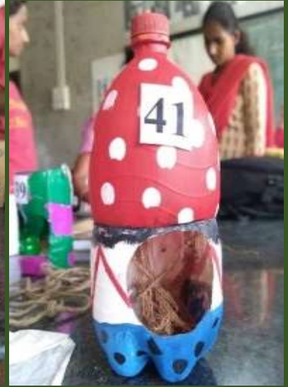
Innovative nests placed for competition/display