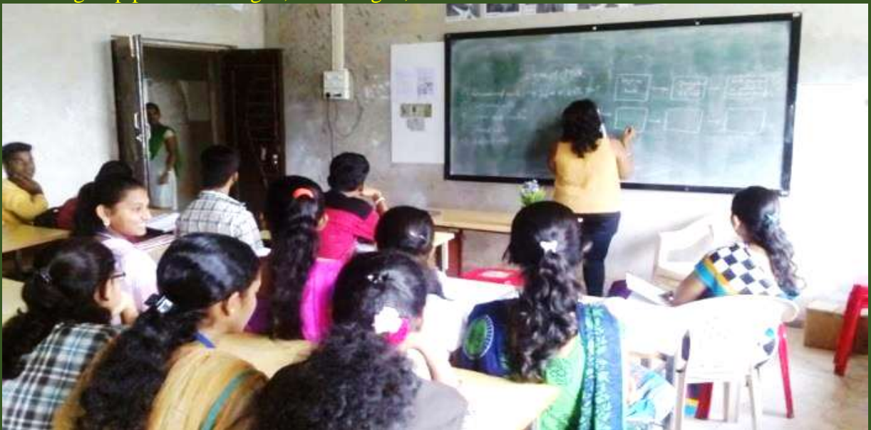
A student of S.Y.B.Sc. during seminar, 2016-17.