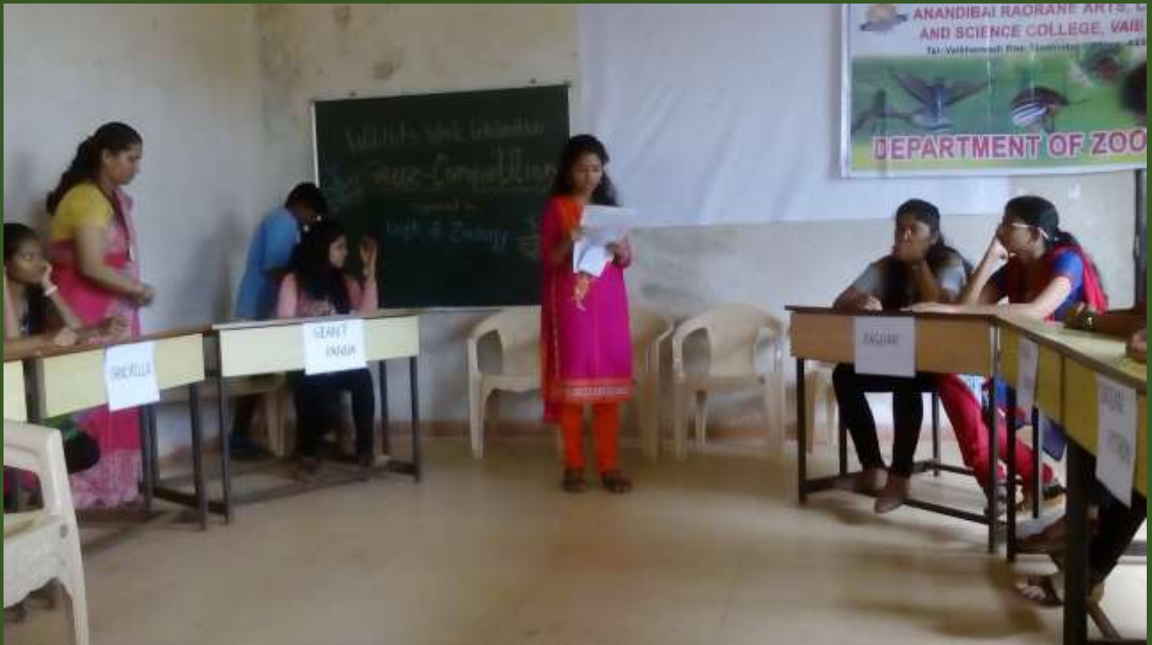
A moment during Quiz Competition,2018-19