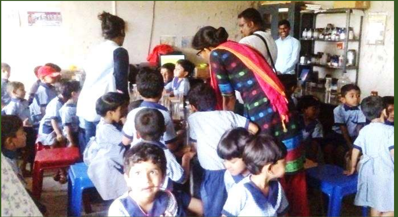
A moment during Animal exhibition for school students