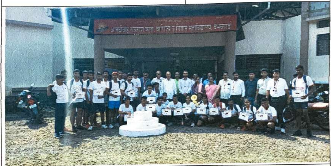
Some glimpses of State Level Anandibai Marathon-2022