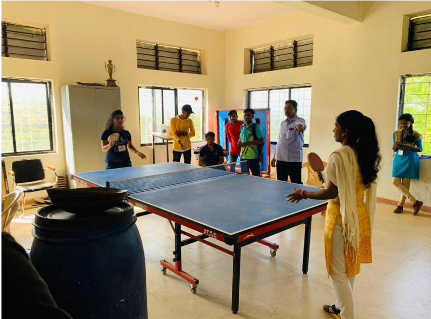
Table Tennis Set