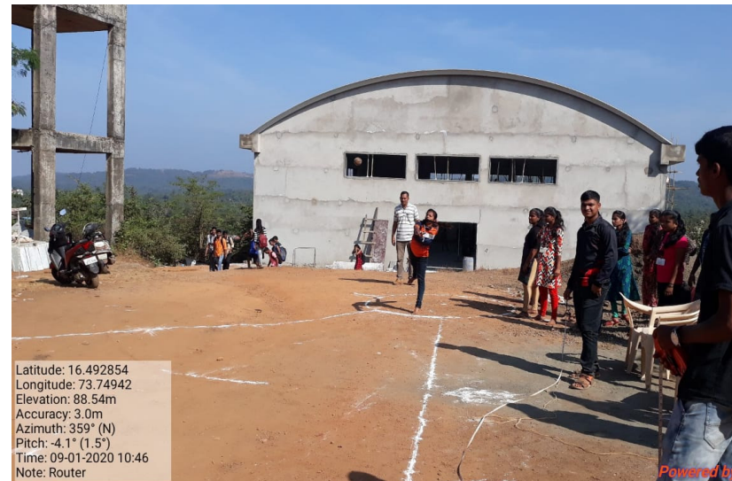
Play Graound II