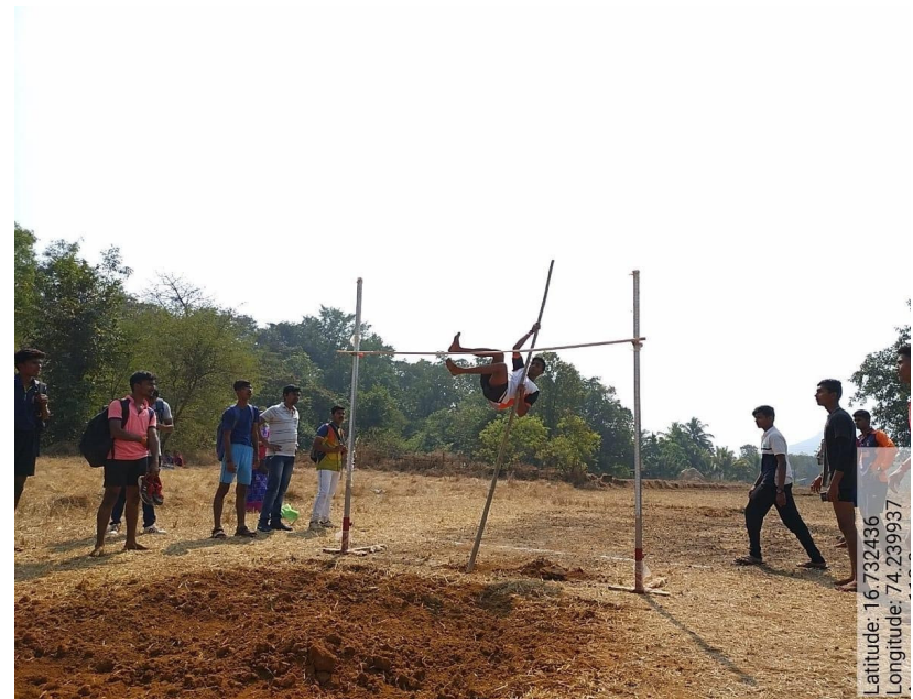
High Jump Set

Latitude: 16.732436 Longitude: 74.239937