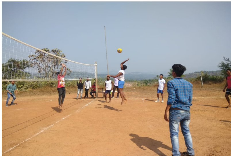
Play Graound I