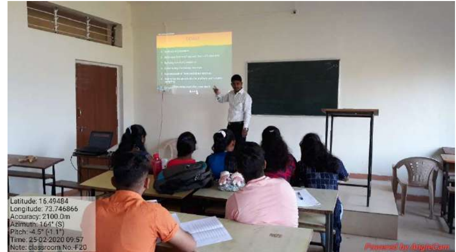
Classroom No.- F20