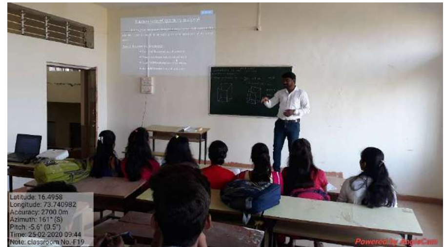
Classroom No.- F19