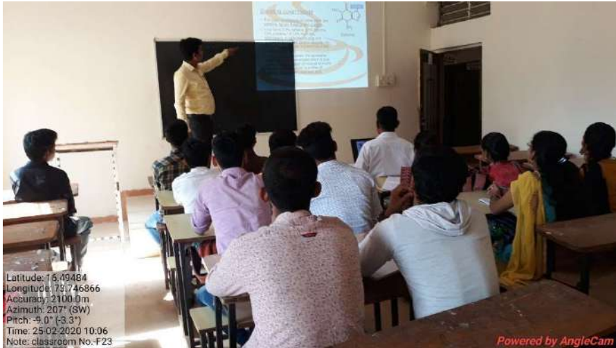
Classroom No. -F23