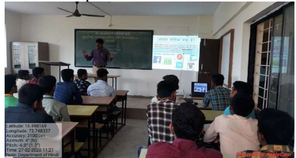
Department of Hindi- B01