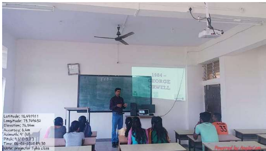
English Department- G08