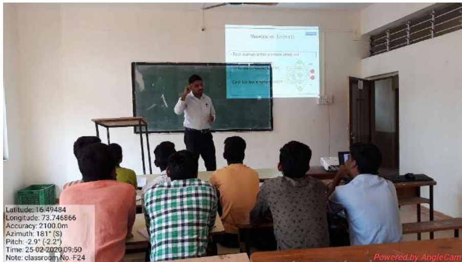
Classroom No.- F24