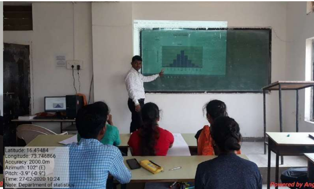
Department of Statistics- G17