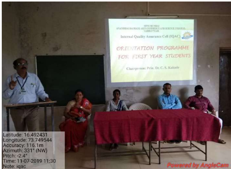
Seminar Hall/Smart Classroom- F26